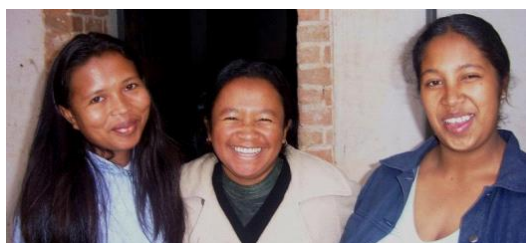
Akany Avoko's Re-introduction team

In 2008, thanks to the kindness of supporters overseas, we were able to establish a "Reintroduction" team of two social workers and a careers officer whose sole focus is ensuring that children and young people leaving Akany Avoko are well prepared for life outside, and that they continue to be monitored and supported once they leave the centre. Over the past year this team has helped more than twenty children and young people leave Akany Avoko and begin new lives outside of the centre. Ensuring that those leaving have a secure place to live and either family to care for them or the means to support themselves independently is the main part of their work. In the past year the team has also ensured that, wherever possible, every child has a copy of their birth certificate and has made a visit to what family members (if any) they have. These visits help us evaluate the viability of a life outside of Akany Avoko for every child at the centre. They also help a great deal with our children's emotional stability.