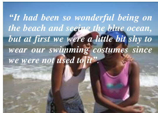
"It had been so wonderful being on the beach and seeing the blue ocean, but at first we were a little bit shy to wear our swimming costumes since we were not used to it".